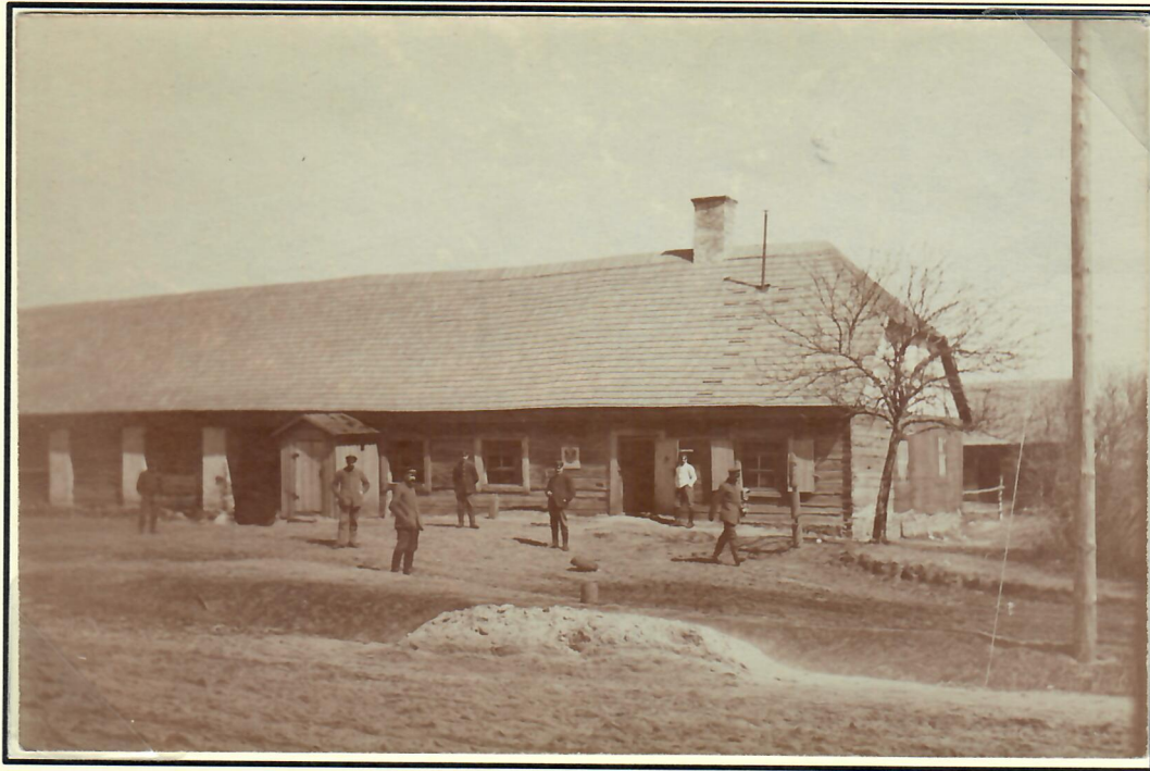
Typography: Photographic silver gelatin