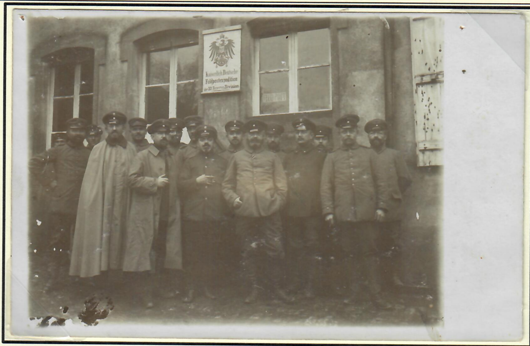
Typography: Photographic gelatin POP