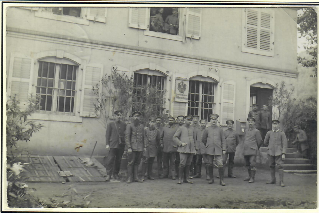
Typography: Photographic silver gelatin