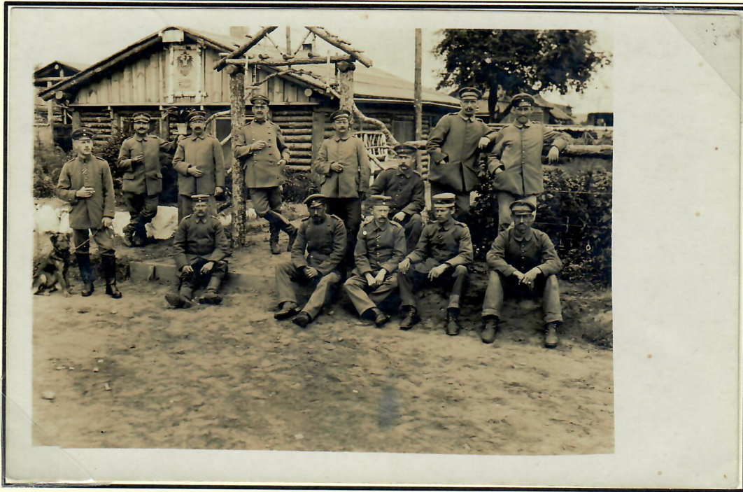
Typography: Photographic silver gelatin