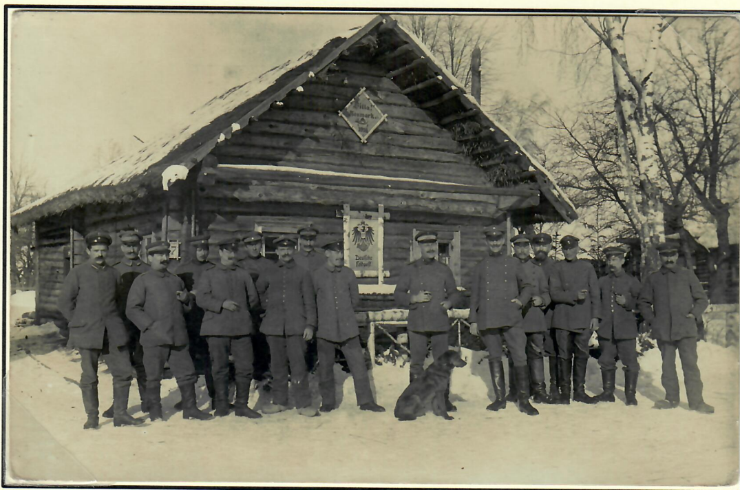
Typography: Photographic gelatin POP

A field post office on the Eastern Front. Postcard is unused, but marked Deutsche Feldpost 974, May 1917. Feldpost 974 was a field post station assigned to the division command of the 1 st Reserve Division. The division was in Latvia at this date.