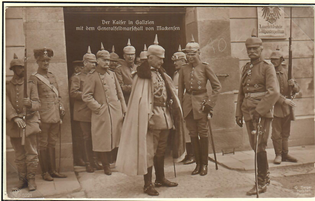
Typography: Photographic bromoil

A field post office in Saint-Etienne-à-Arnes, France. Postcard is sent with the field post in October 1916.