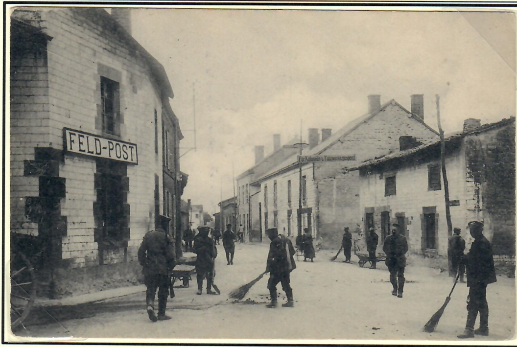
Typography: Photomechanical colotype