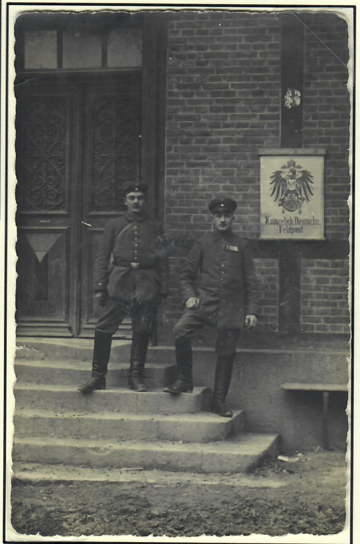
Photographer: Unknown Publisher: Private Typography: Photographic bromoil

A small concert outside the field post office, the soldier to the right is more interested in his mail and parcels than the music.