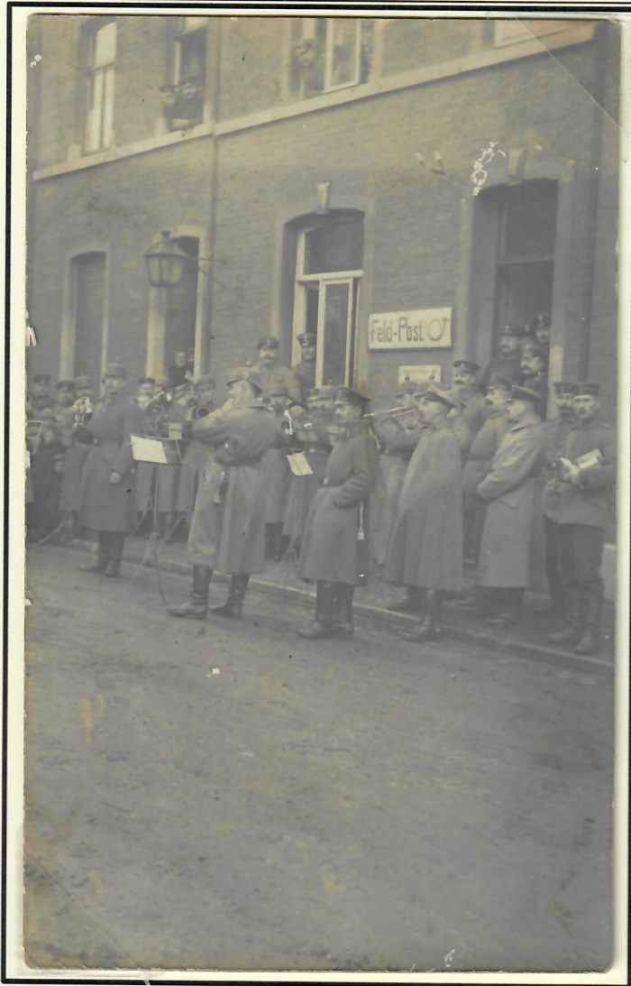
Photographer: Unknown Publisher: Private Typography: Photographic bromoil

A small concert outside the field post office, the soldier to the right is more interested in his mail and parcels than the music.