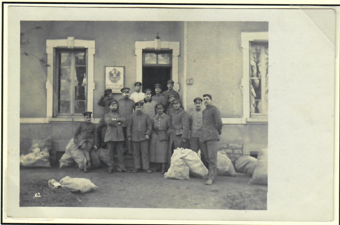
Typography : Photographic bromoil

Outside a field post office on the Western front. The postcard is written but not sent, dated in December 1917.