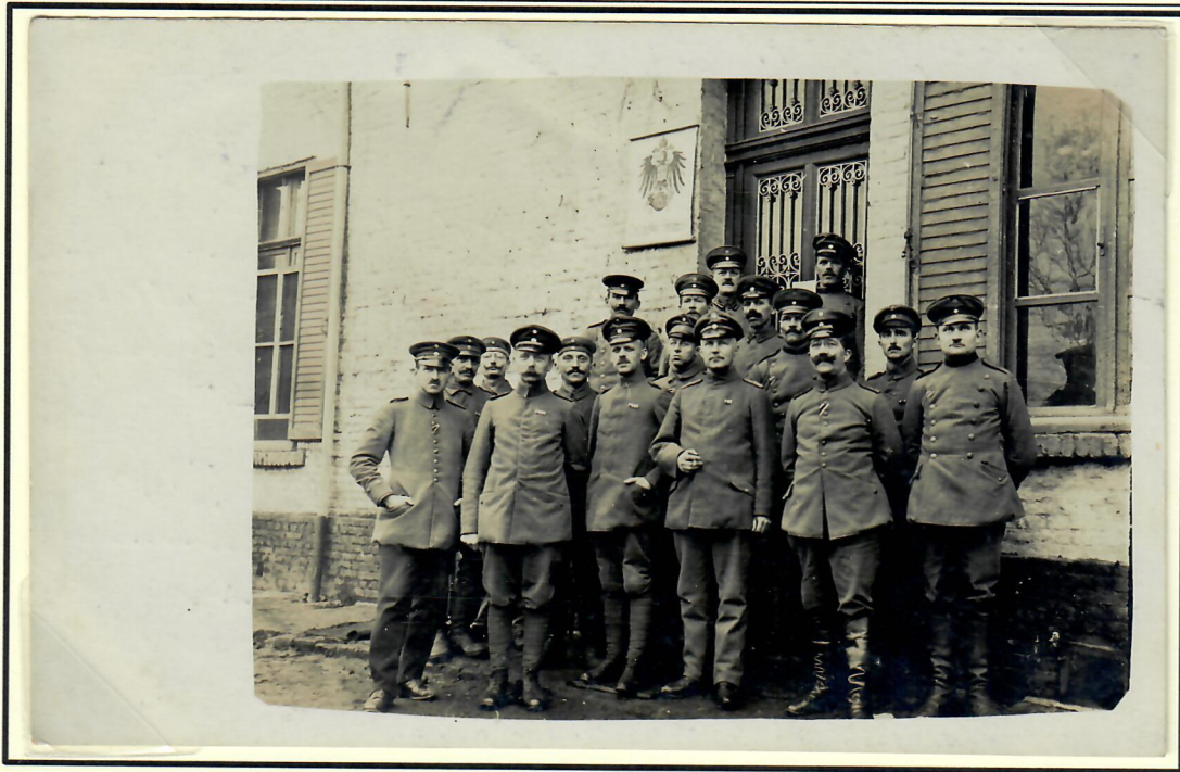
Typography: Photographic silver gelatin