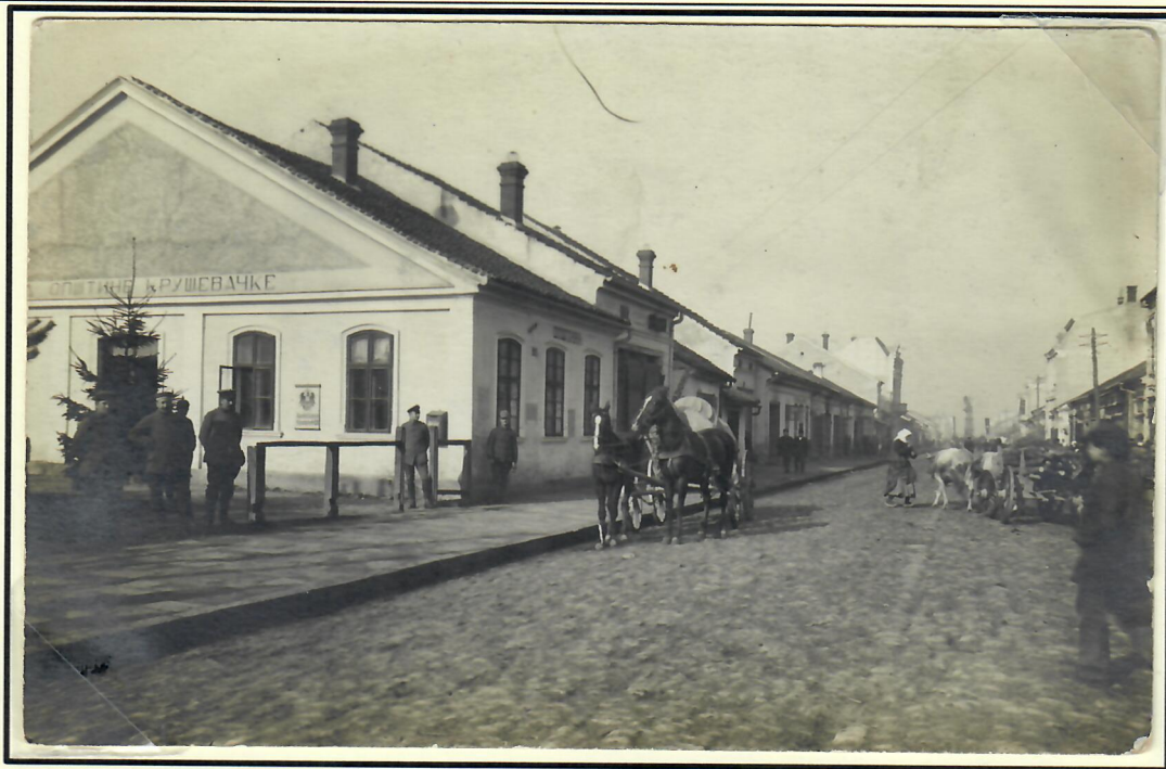
Typography: Photographic silver gelatin