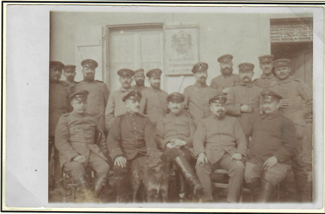
Typography: Photographic gelatin POP