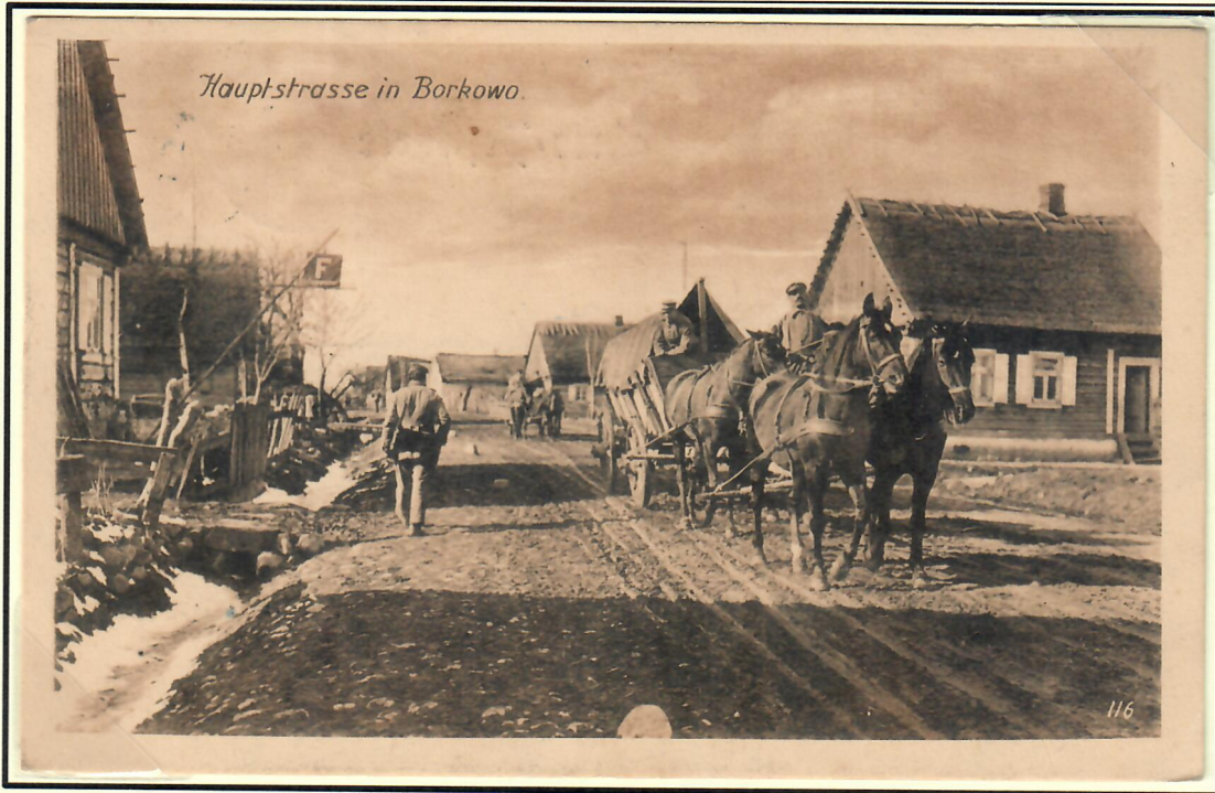
Typography: Photomechanical collotype