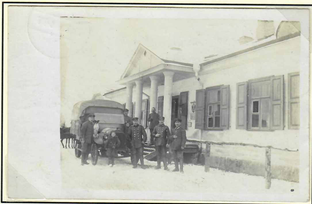
Typography: Photographic silver gelatin

A soldier with some packages outside the field post office on the Eastern front. The postcard is marked with Feldpost 683, and indicating that it is the field post office 683 attached to the 18 th Landwehr division located east of Posnan at the actual time. Field post office 683 was established on 15 th February 1917, so the picture is taken some during the summer of 1917 (the unit was transferred to Western front at the end of the war).