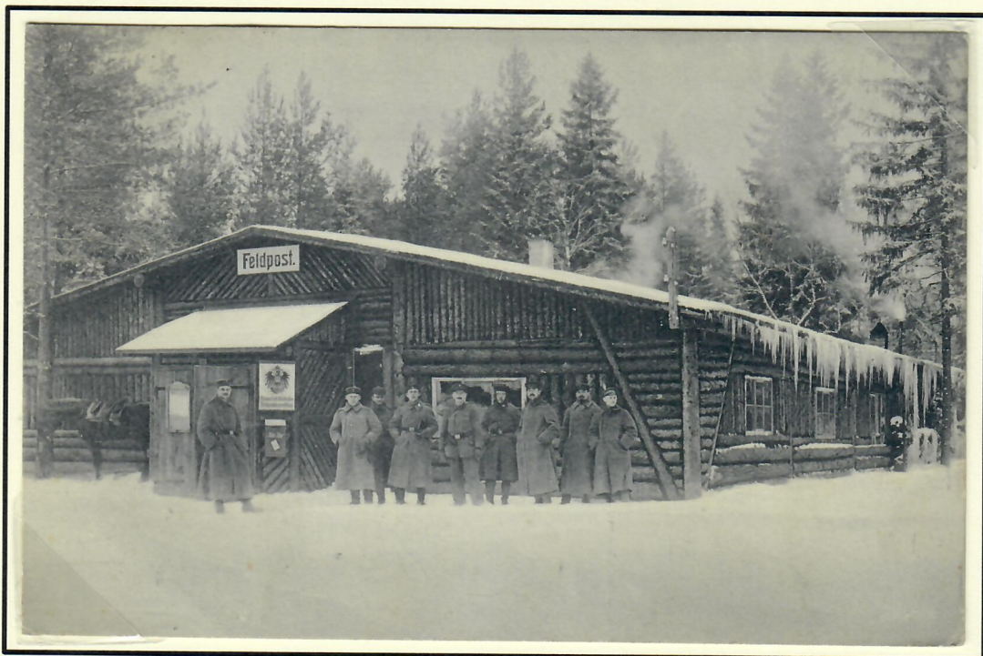
Typography: Photomechanical collotype