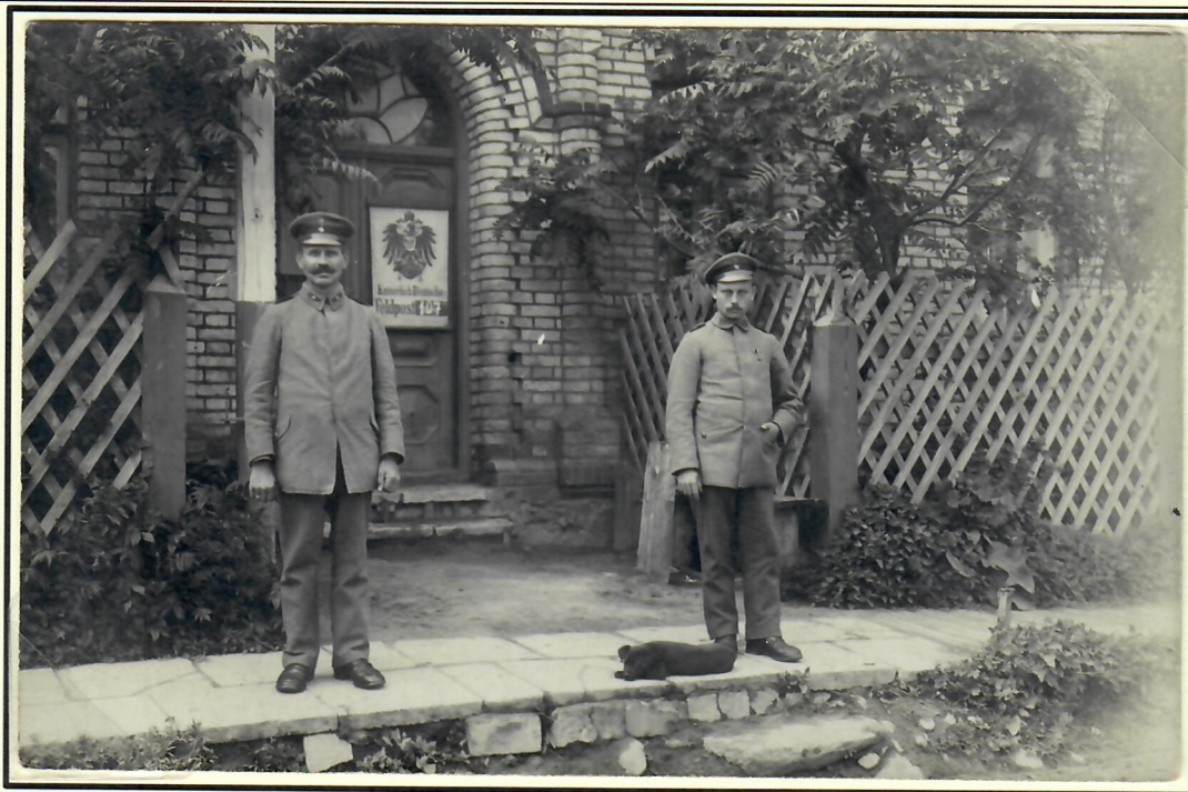
Typography: Photographic silver gelatin