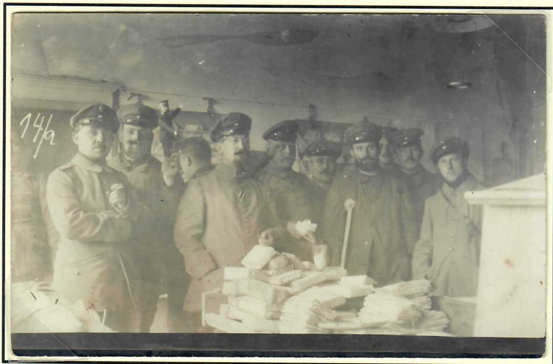
Typography: Photographic gelatin POP

Outside the Feldpostexpedition for the 33 rd Reserve Division. The postcard is notified with March 1915. In 1915 this unit participated in battles between Maas and Mosel.