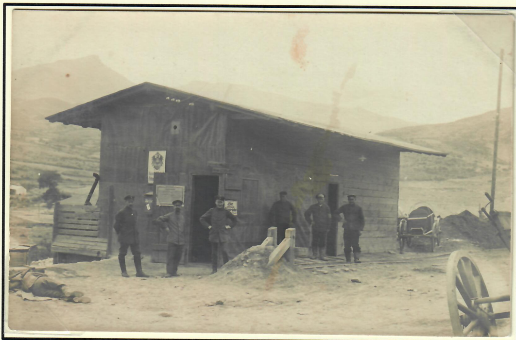
Typography: Photographic silver gelatin

Feldpoststation 239 located in Kruševac (Крушевац), Serbia. Postcard is sent with the field post in April 1916.