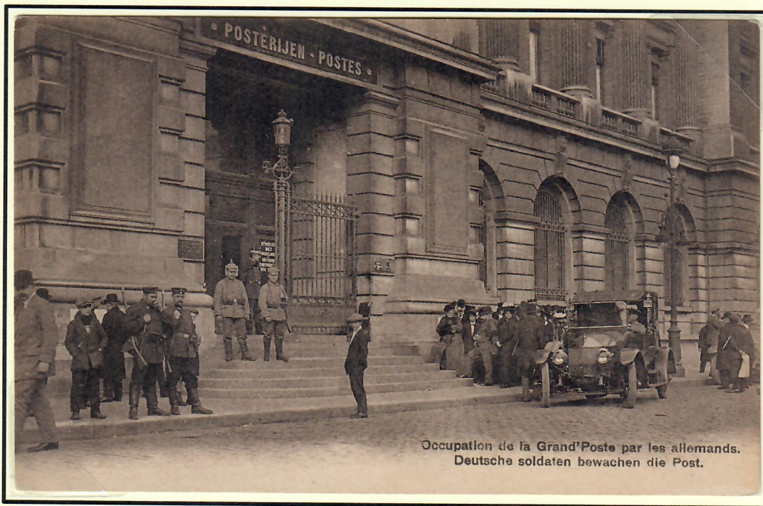
Occupation de la Grand'Poste par les allemands. Deutsche soldaten bewachen die Post.