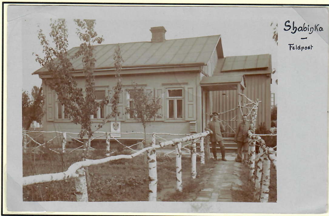
Typography: Photographic gelatin POP

A field post office on the Eastern Front. Postcard is sent from Feldpost 169, July 1917. This field post unit was assigned to the “Grenzschutz Ost”.