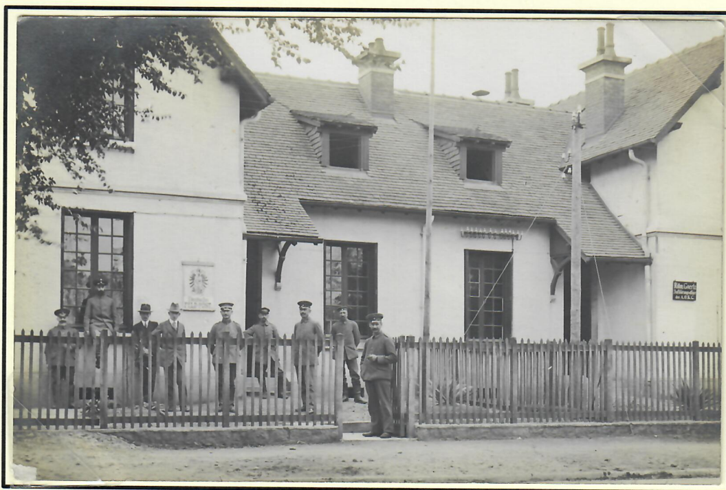
Typography: Photographic silver gelatin

Soldiers outside the Feldpoststation 129, most likely in St. Kreuz im Lebertal (Elsass at that time) (today Sainte-Croix-aux-Mines, France). Postcard is sent with the field post in September 1916 from this field post office.