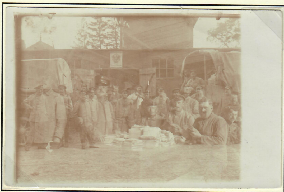
Typography: Photographic gelatin POP

Outside the Feldpostexpedition for the 33 rd Reserve Division on another location, but still on the Western front.