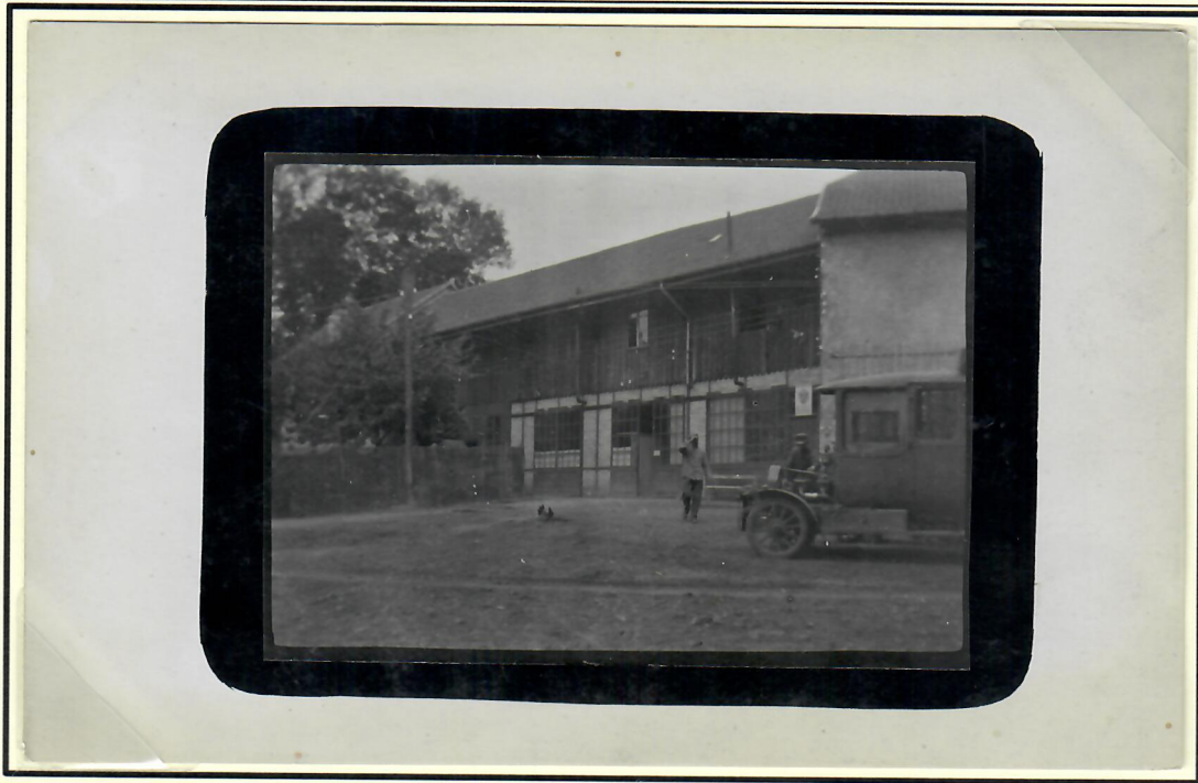
Typography: Photographic silver gelatin