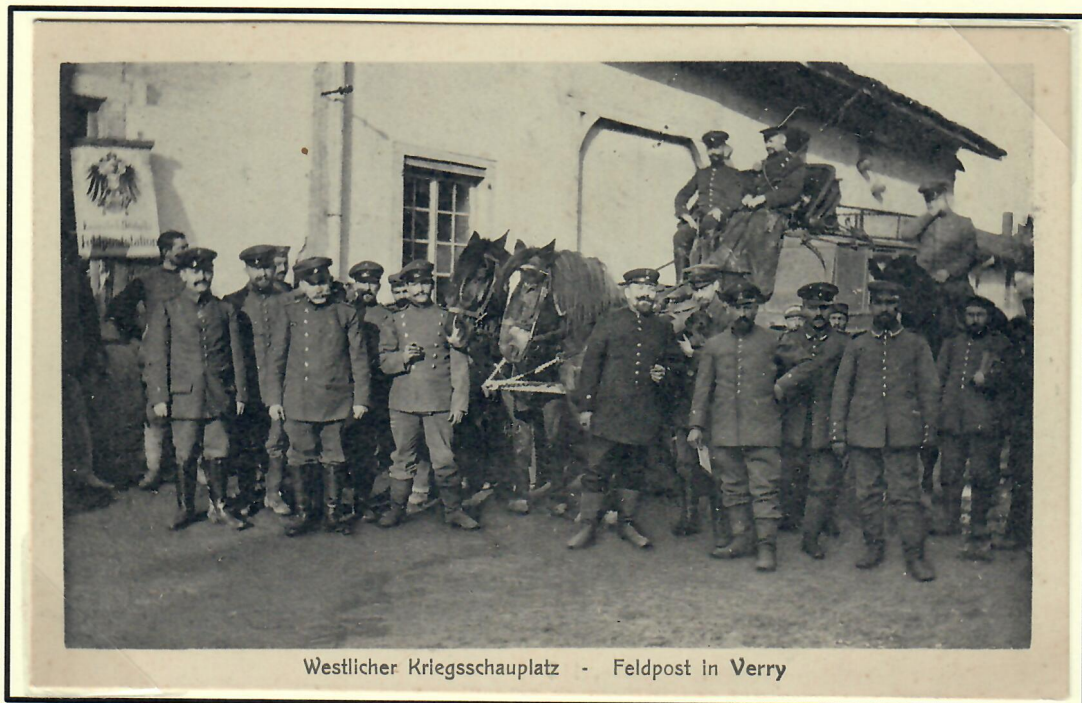
Photographer: Kunstanstalt von N. Engel, Diedenhofen & W. Engel Typography: Photomechanical collotype

Mainstreet in Borkowo, Polen. The letter "F" on the photo marks where the field post office was located. Postcard is sent in November 1916.