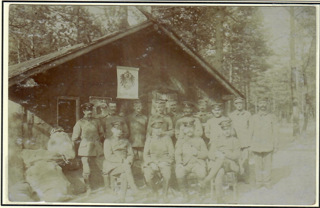
Typography: Photographic gelatin POP